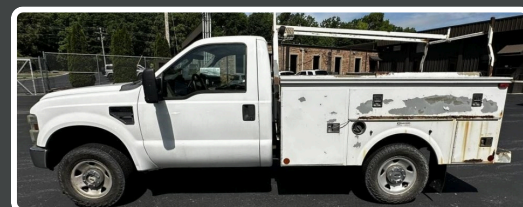
2007 Cookeville Hwy Livingston TN